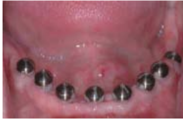
1. Eight implants are placed in the mandible for a fixed restoration.