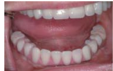
9. The occlusion is adjusted as necessary. A protective material is placed over the screw heads, the access holes are sealed with composite and polished. The patient is instructed on proper oral hygiene of the prosthesis.

3i, A BIOMET Company Global Headquarters 4555 Riverside Drive Palm Beach Gardens, FL 33410 1-800-342-5454 Outside The U.S.: +1-561-776-6700 Fax: +1-561-776-1272 www.3i-online.com