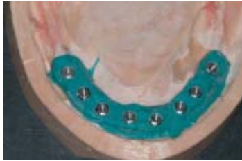
2. An implant level impression is made and a soft-tissue master cast is poured.