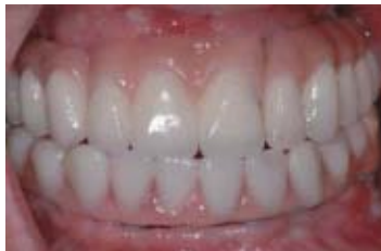
8. The healing abutments are removed from the implants. The fixed-hybrid prosthesis is placed onto the implants and secured using hexed Gold-Tite® Abutment Screws torqued to 20Ncm.