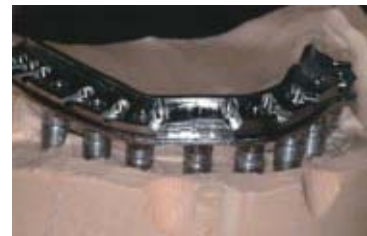
6. The design is transferred to the milling machine and the bar is milled from a solid block of titanium alloy. The CAM StructSURE™ Bar is milled with a raised lingual for retention of the denture teeth and acrylic resin. The finished CAM StructSURE Fixed-Hybrid is returned to the laboratory.