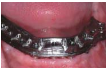
7. The CAM StructSURE Precision Milled Bar is sent to the clinician for the final try-in. Once verified, the bar is returned to the laboratory where it is opaqued and then the teeth are processed onto the bar using acrylic resin. The prosthesis is finished, polished and returned to the clinician.