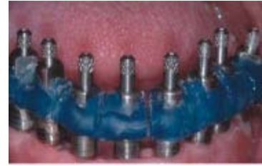
3. The verification index is fabricated on the cast by luting the impression copings together with a low expansion resin. If the index does not seat passively, it may be sectioned and luted in the correct position intraorally.