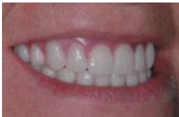
4. After the soft tissue cast is verified for accuracy, the occlusal records are made, casts are articulated and the lower teeth are set and returned for the wax try-in.